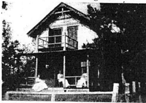
Some Currier ancestors relax on the porch